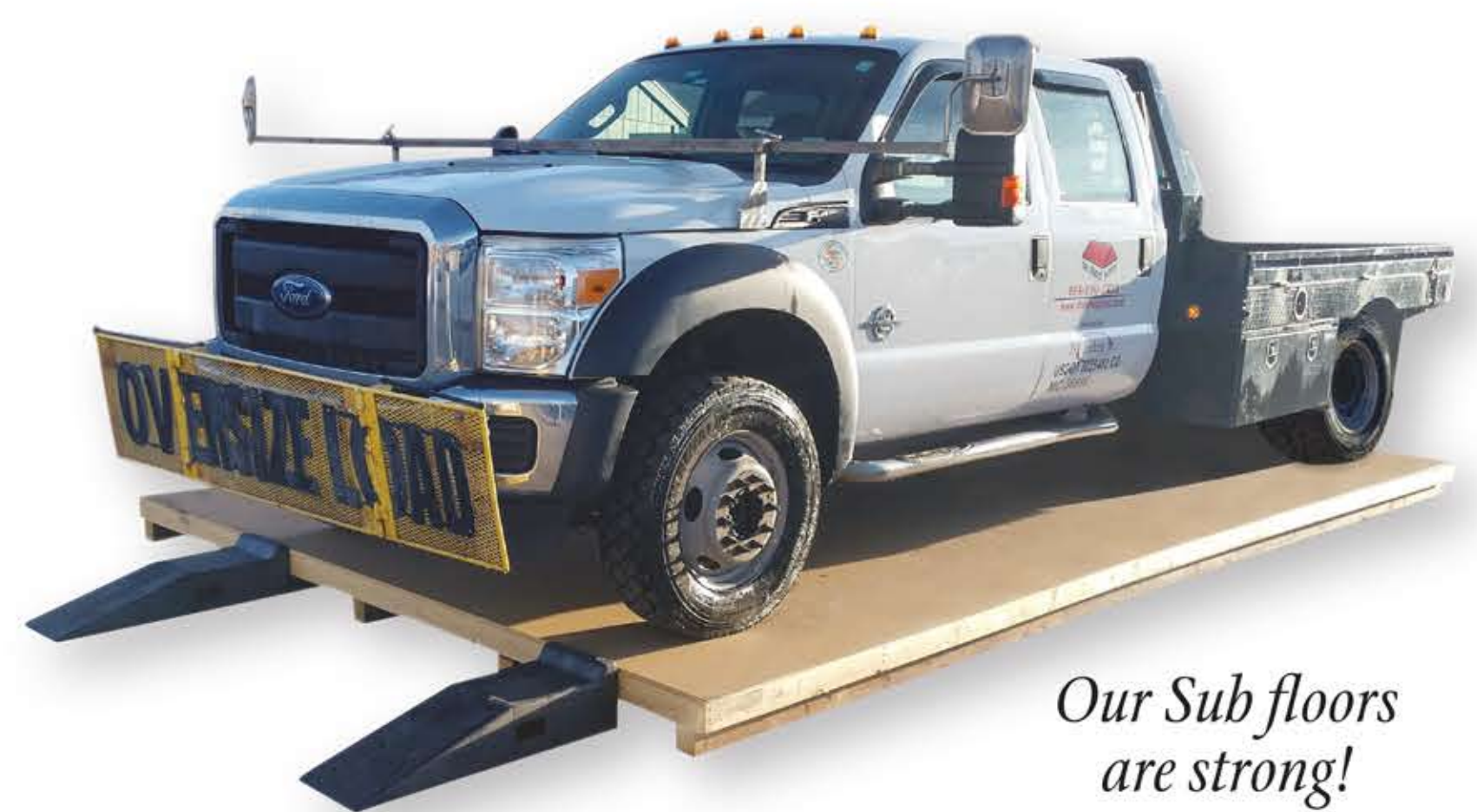
Our Sub floors are strong!